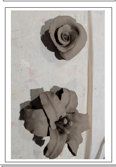
Moan Continue Page 2